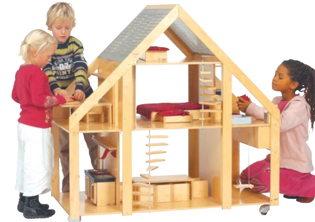
Hours of fun with the LILIANE doll's villa.