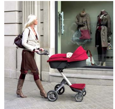
The award winning STOKKE™ Xplory® buggy.

lot of free publicity, with frequent phone calls from journalists seeking Sterre & Tijn Amsterdam's expert opinion on certain new products or developments in the branch.