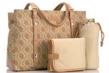
The trendy STORKSAK baby care bag.

What you didn't know In the world of children's products, the Netherlands sets the trends for Europe. The west of the country sets the trends for the Netherlands. Amsterdam sets the trend for the west of the country. And guess what? Sterre & Tijn Amsterdam sets the trends for Amsterdam, and thus for Europe.